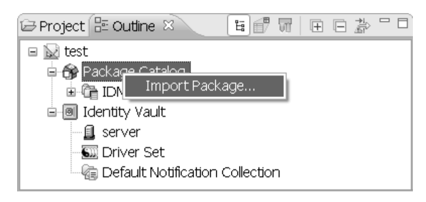
Figure 3-1 Import Package