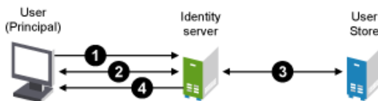
Figure 2-2 How the Authentication Class Handles a User Request.

Figure 2-2 illustrates an example of how an authentication class is used to authenticate to an Identity Server. It uses a single user store located on an LDAP server to verify name and password credentials.