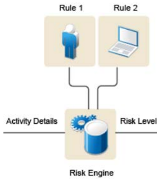
Figure 5-1 Risk Engine evaluating Rules

Risk Engine collects all the activity details of the connecting user and passes it on to the rules for evaluation. These include IP address of the connecting client, HTTP headers, Cookies, User attributes, user historical data etc.